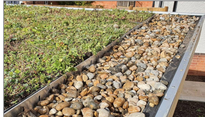
Edge Trim ZP 80 A by OPTIGRÜN ROOF GREENING