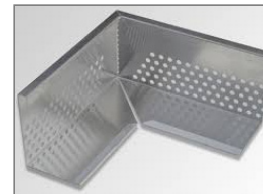
Corner [441-EDG-0390] Dimensions (H x W x L): 3" x 3 1/2" x 7 7/8" (each side)