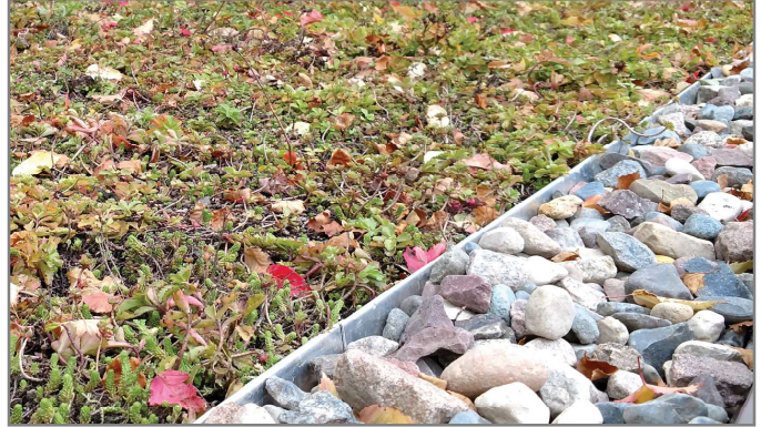
Edge Trim ZP 150 A by