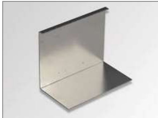
Male Clip [442-EDG-05M] Dimensions (H x W x L): 4 3/4" x 5 1/4" x 5"