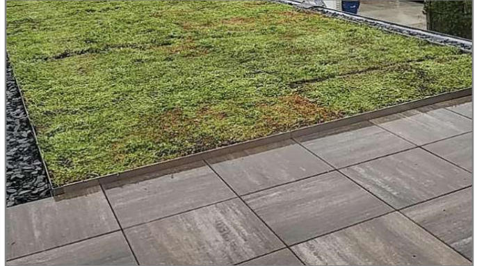
Edge Trim ZP 120 A by