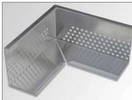
Corner [442-EDG-90] Dimensions (H x W x L): 5" x 5 1/2" x 7 7/8" (each side)