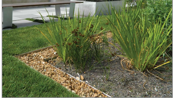
Edge Trim ZP 100 A by