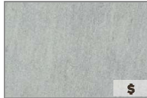
LIGHT GREY NEXTONE