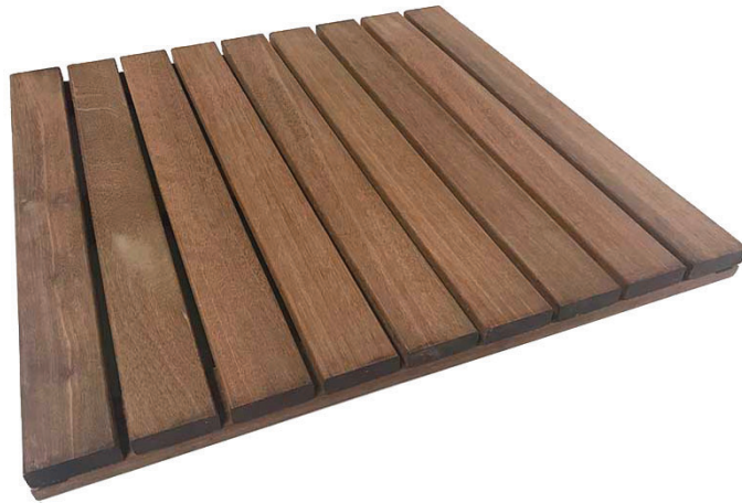
24" x 24" WOOD DECK TILE

Wood Deck Tiles come in two standard sizes: 24" x 24" squares and 48" x 24" rectangles. Each wood option below can be ordered in either size to suit your decking needs and design aesthetic.